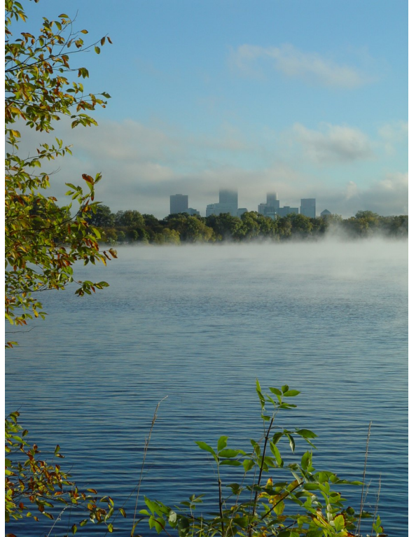
Lakes Area Realty services all of the Twin Cities metro area and into greater Minnesota.